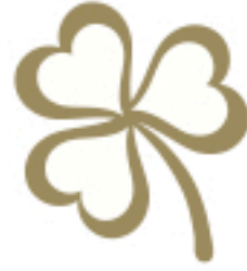
Republic of Ireland

Gold supply: Economic contribution of gold production in 2012 in the 15 largest producing countries estimated to be > $78 billion